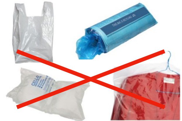
plastic bags and films (check your local grocery store)