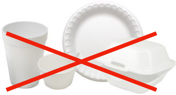
Foam cups and containers (check website for options)